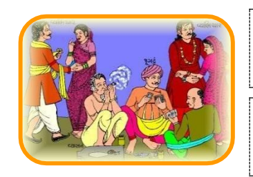
Never gamble or smoke